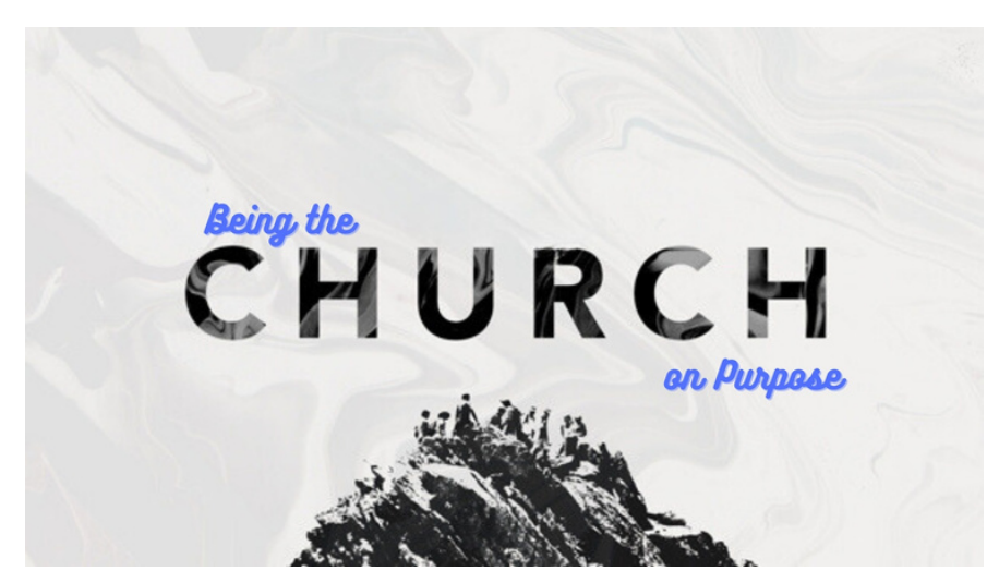
Eat My Dust!

Joshua 1:1-7 The Church Should Approach Life from a Position of Victory