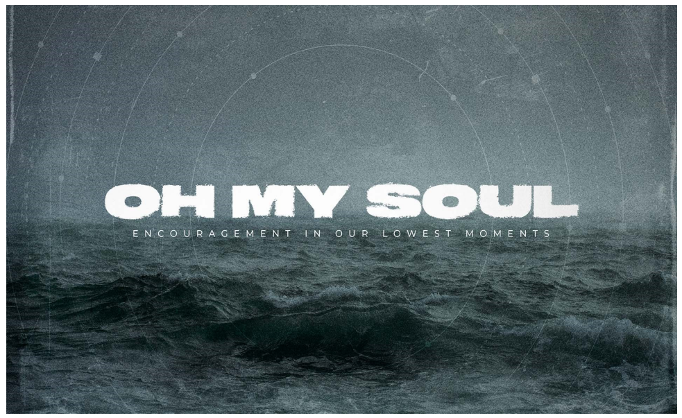
Oh, My Soul: Encouragement in Our Lowest Moments Week 1: 'Despair & Hope'