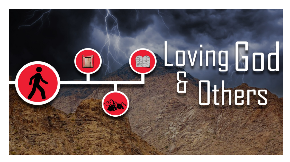
Bible Engagement Project | Stepping Out

Then God gave the people all these instructions: