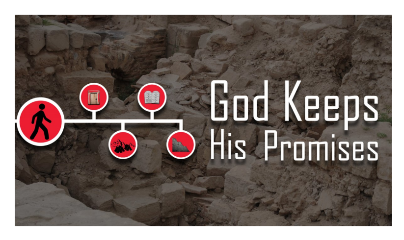
Bible Engagement Project | Stepping Out